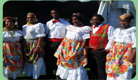
CDOA Cultural Dancers Caribbean folk dancing in national costumes