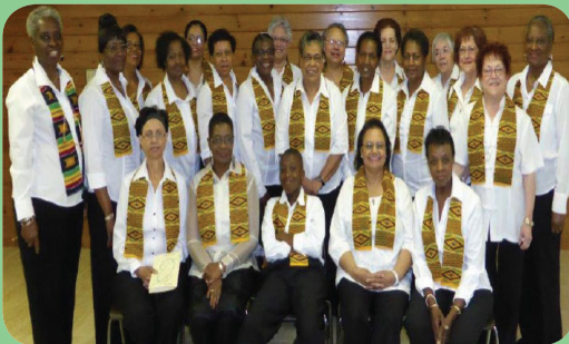
St. Roses & Bishop's High School Alumni Ensemble Folksong, Sing Alongs