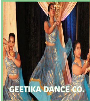
GEETIKA DANCE CO.